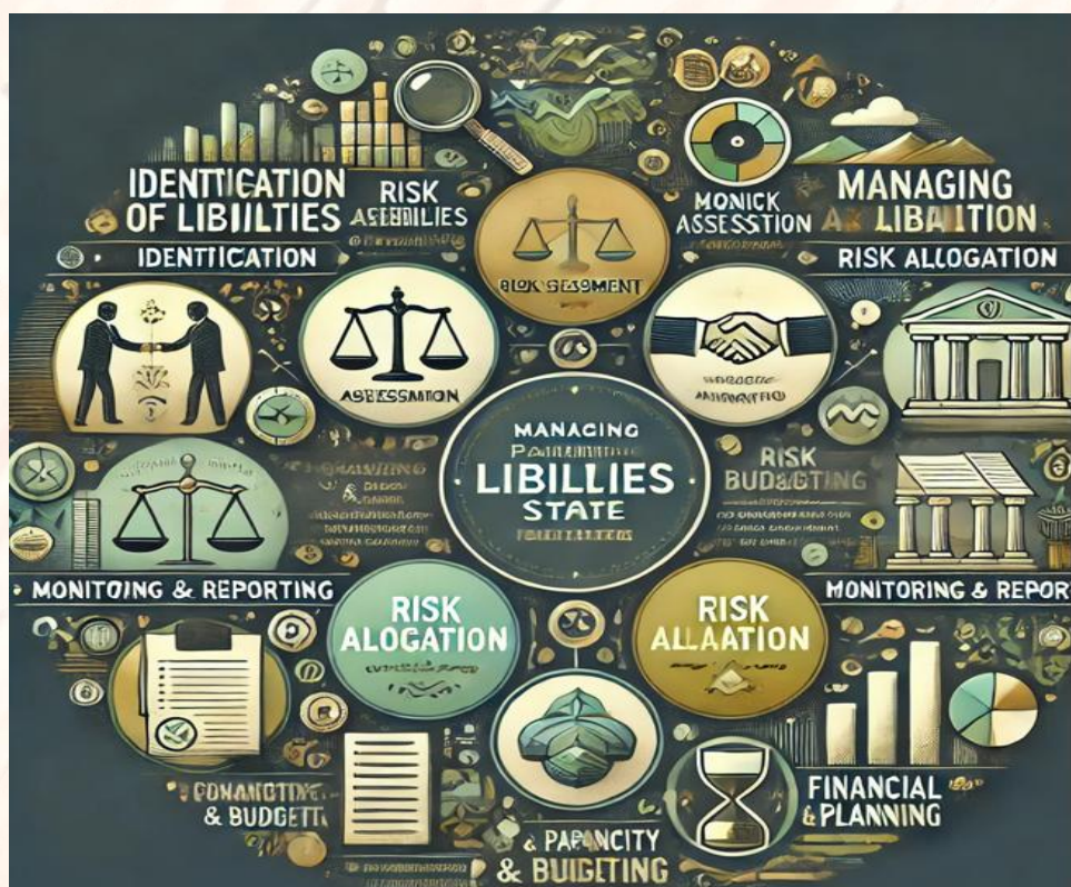
Figure 3: Summary of risk profile

The second step is to identify and register direct and contingent commitments. They shall be consolidated in the “Fiscal Commitments Register” shown in Chart 4 below. It contains types of the liabilities, description of adjustment factors and trigger events, and the location (which will depend on the stage of the project).